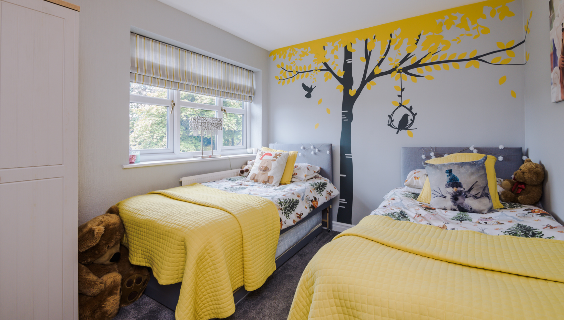
NESTLED BESIDE THE BATHROOM IS A SUNNY TWIN BEDROOM, ECLECTICALLY DECORATED IN MUTED GREY AND BUTTERCUP TONES.